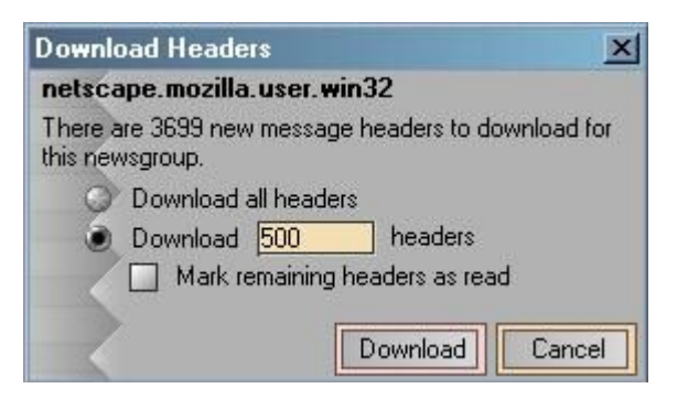
Figure 4.4: Downloading News Headers

Downloading Headers Now that we have some newsgroups listed in our folder pane, let's see what content is available therein. In your folder pane on the left, you should see a listing of the groups to which you have subscribed under the name of the newsgroup account. When you click on one of these groups, Mozilla will ask the server how many active messages there are in the group. If it is more than specified in the Server Settings portion, then it will ask you how many headers you want to get. (See Figure 4.4 Notice, in