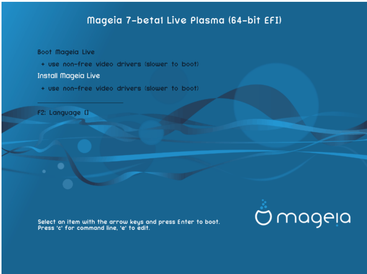
First screen while booting in UEFI mode